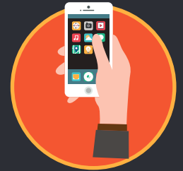
Mobile App & Delivery Tracking