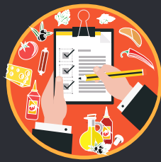
Raw Material Inventory